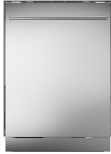
DBI565THXXLS Tubular Handle Built-In, XXL Stainless Steel Interface: Logic