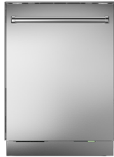
DBI565PHXXLS Pro Handle Built-In, XXL Stainless Steel Interface: Logic