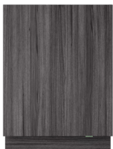
DSD565 Panel Ready, Sliding Door, XL Interface: Logic ADA Height