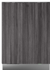
DFI565XXLSOF Panel Ready, XXL Interface: Logic Water Softener