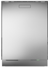
DBI565IXXLS Pocket Handle Built-In, XXL Stainless Steel Interface: Logic