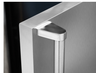
Pro-Style Stainless Steel Panel