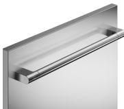
ASKO Pro Handle