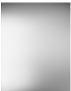
ASKO No Handle, Push-to-Open