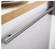
ASKO T-Bar Handle