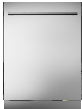
DBI5646PS ASKO Pro Handle, XL Stainless Steel Interface: Logic ADA Height