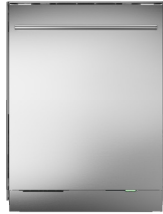
DBI564TS ASKO T-bar Handle Built-In, XL Stainless Steel Interface: Logic ADA Height