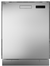
DBI364IS Pocket Handle Built-In, XL Stainless Steel Interface: Classic ADA Height