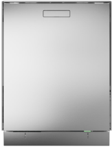
DBI564ISSOF Pocket Handle Built-In, XL Stainless Steel Interface: Logic Water Softener ADA Height