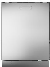
DBI564IXXLS Pocket Handle Built-In, XXL Stainless Steel Interface: Logic